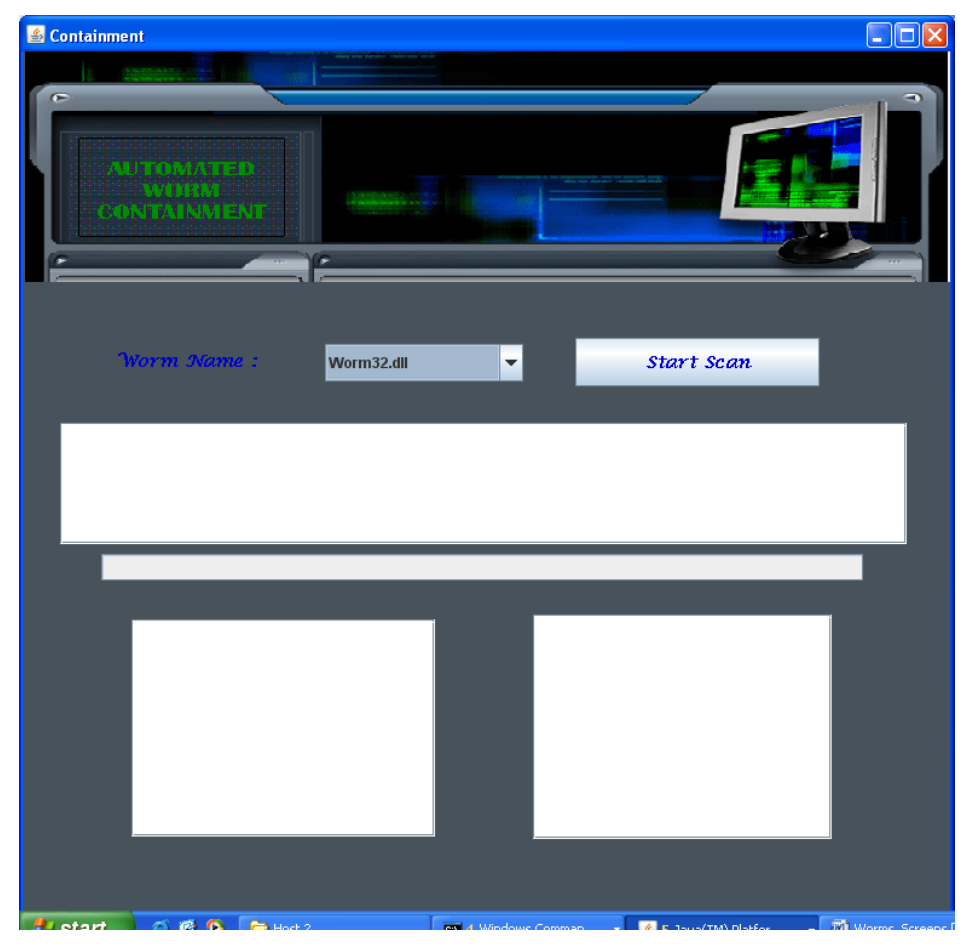
Fig 4 Host info and scan