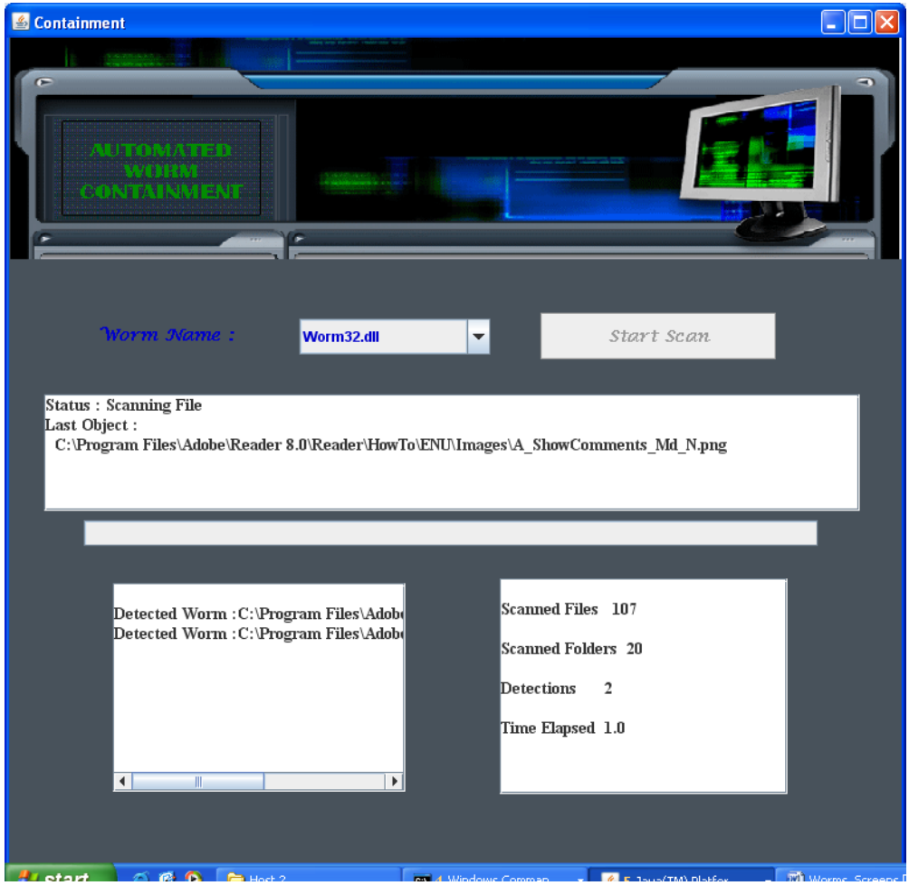
Fig 6 Scanning for Worm and detection

Vol. 1, Issue 4, pp. 1565-1571 Fig 5 Containment